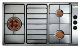
▲ Side Control Panel with FREE lighter