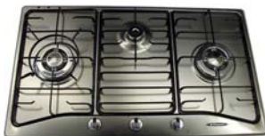
▲ Front control panel with auto ignition