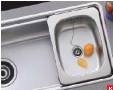
You may need small sink bowl for simple job or double sink bowl for cleaning and rinsing. Extra sliding bowl (JSB 27) is provided for your convenience, made of stainless steel.