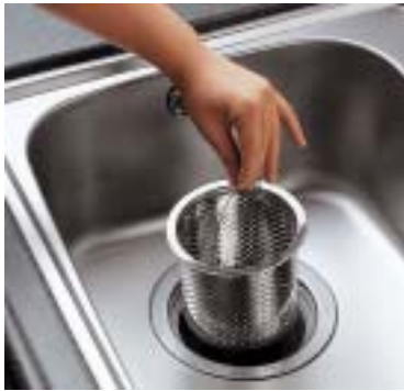
Large type drainage set (diameter 160mm) with stainless steel basket which has better effect of collecting garbage and easy cleaning.