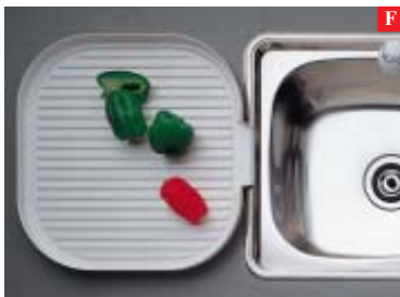
In addition to capturing water and returning it to the bowl, drainer tray (AC 200) is a convenient place for the drying of dishes, pots and cutlery.