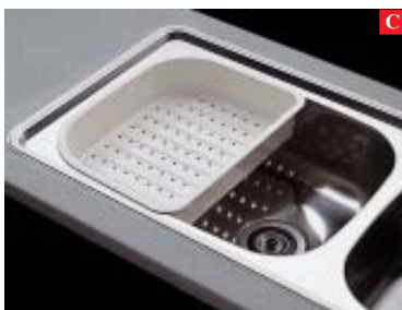
Plastic colander tray (AC 201) especially designed for 510 mm bowl provides you extra space and function for your cooking and cleaning works.