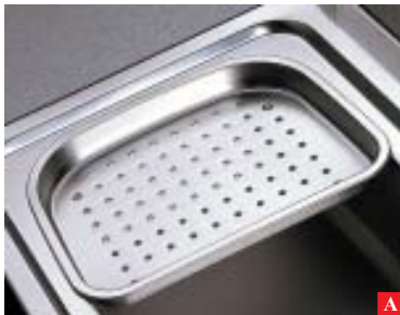
Stainless steel colander tray (AD 30) is designed to fit into the bowl. It is not only a drainer for wet bowls and cups, but also a convenient tray for processing vegetables, fruit and fish.